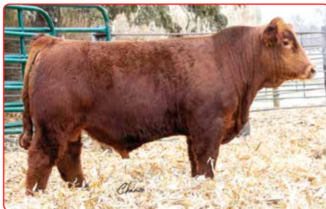
Rockin H Mr. Houston H34, Son selling as Lot 9

Pasture Sire: Rockin H Mr. Gus G83 • Due: 4-28-21 • Safe Est PM EPDs: 9 2.05 80 116 .23 3 21 61 15 8.85 Carcass: 28.55 -.47 .14 -.10 .92 130 79