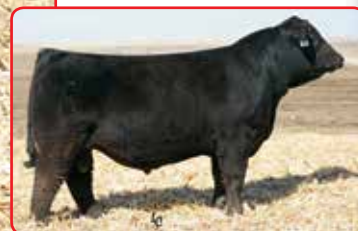
CCR Cowboy Cut 5048Z, Sire

Young CCR Cowboy Cut daughter, great disposition, feet and udder.