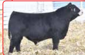
TJ Teardrop 783F, Sire