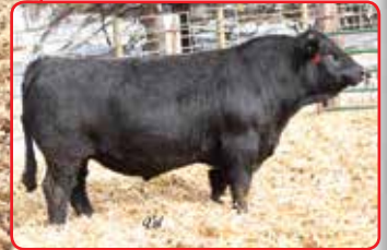
Rockin H Mr. Boise F66, Pasture Sire

Purebred CDI Authority daughter out of Rita Dream, this combination has worked really well for us over the years. Diamond is a great young cow with alot of future left yet.