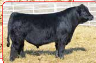
KBHR High Road E283, Sire