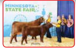
HILB/SHER Loaded Beauty, Dam

HTP/SVF Duracell T52 HPF Quantum Leap Z952 RP/MP Right To Love 015U W/C Loaded Up 1119Y HILB/SHER Loaded Beauty HSF/HS Sheza Beauty U823