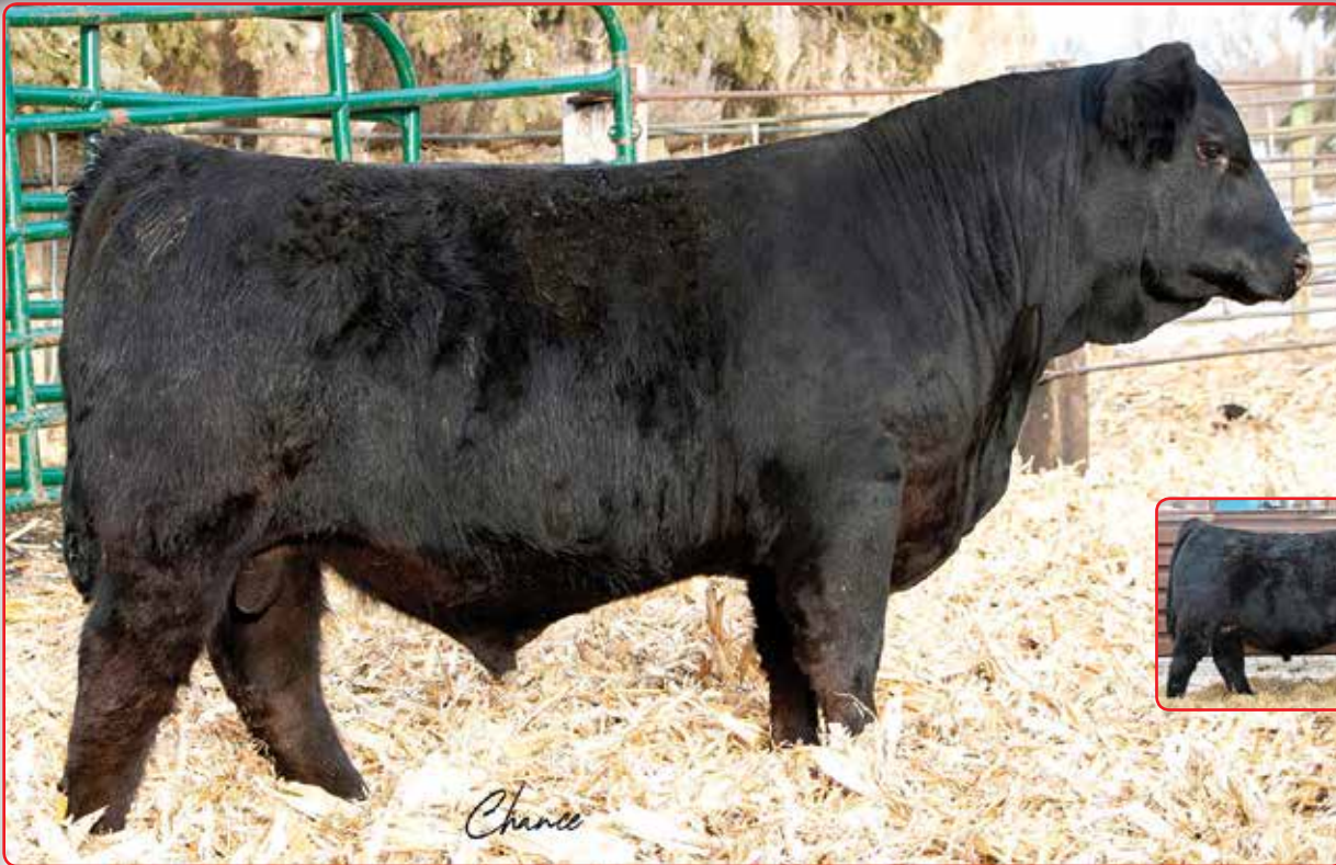
BCLR Cash Flow C820, Sire