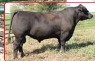
TJ Franchise 451D, Sire