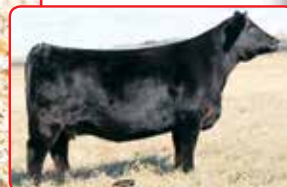
AJE Miss Gracie Y7, Grandam