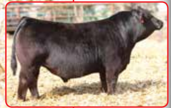
Rockin H Mr Smokeshow 601, $10,000 Full Brother