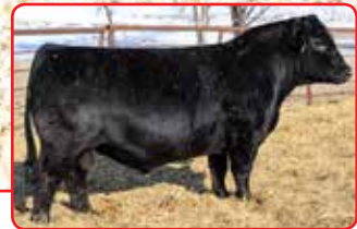
Rubys Turnpike 771E, Sire