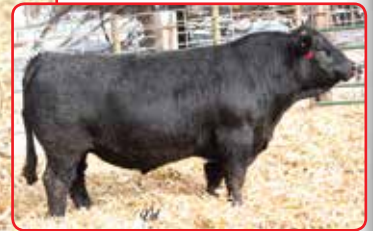
Rockin H Mr. Boise F66, Pasture Sire

1/2 Blood Grandmaster cow that has produced replacements and bulls for us.