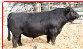
Rockin H Mr. Boise F66, Pasture Sire