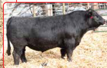
Rockin H Mr. Boise F66, Pasture Sire

Purebred Lizzys Pearl daughter sired by WS Beef King. This young cow produced one of our top bulls last year.