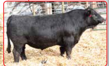
Rockin H Mr. Boise F66, Pasture Sire

S A V Brilliance daughter marked with a little bit of white on her head.